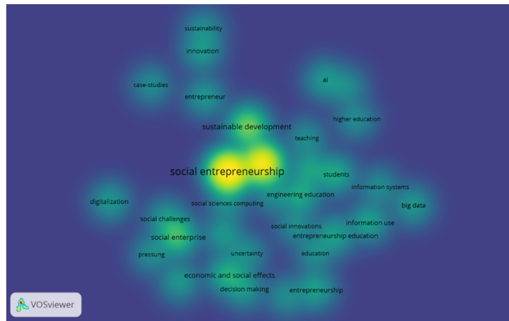
Figure 3. Density Visualization

Sustainable development occupies an intermediate temporal position, suggesting that while sustainability has been present in the discourse for several years, its connection to AI-enabled approaches is intensifying. This reflects broader global research trends linking digital technologies with sustainable development goals (C. Wang et al., 2026), (B & Ouchen, 2024).